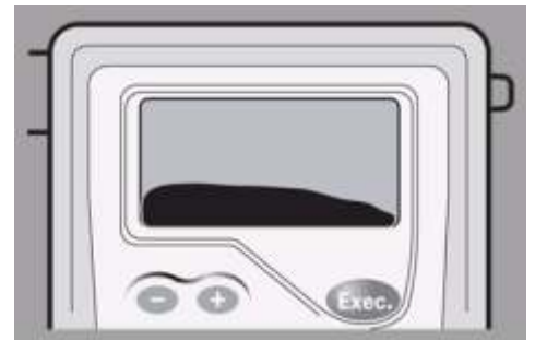
Breath Sample Graph